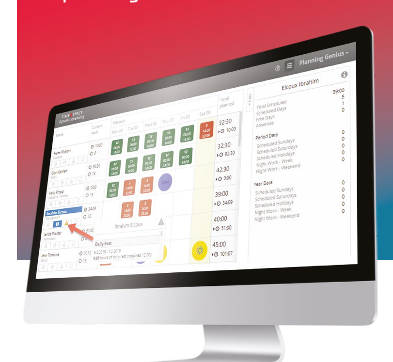
Alerts about legal restrictions

Dynamic Scheduling is an enterprise solution for scheduling working hours that simplifies planning and reduces costs.