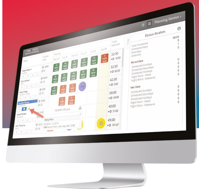
Alerts about legal restrictions

Dynamic Scheduling is an enterprise solution for scheduling working hours that simplifies planning and reduces costs.